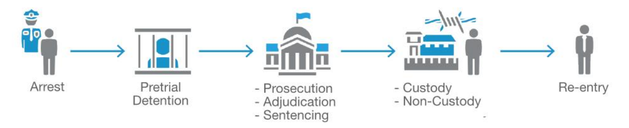
FIGURE 1: CORRECTIONS INFORMATION STAKEHOLDERS

Figure 1 provides an illustration of the stages in the criminal justice system using the primary decisions that influence process flows and outcomes. These stages include entry into the system (arrest), pretrial detention, prosecution, sentencing, sentence modification, and reentry. This white paper will explore the value of sharing corrections data throughout the criminal justice system life cycle.